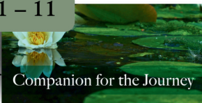
Companion for the Journey